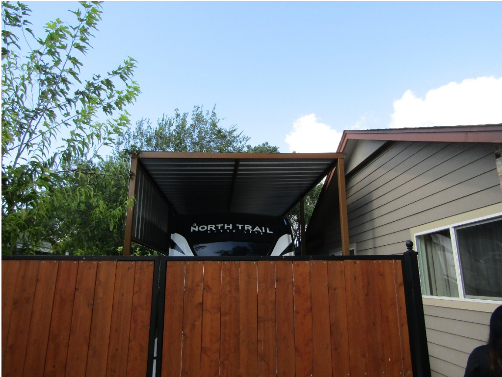
Detached from Existing Structure