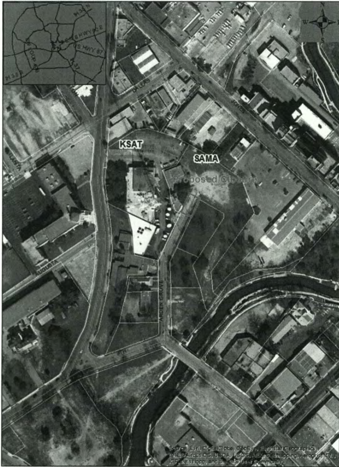
S.P. 1961 City of San Antonio request to close, vacate and abandon an unimproved portion of Arden Grove