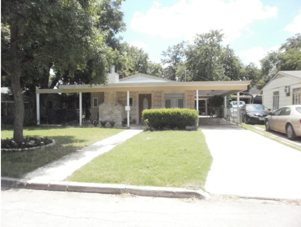
Carport on the side property line