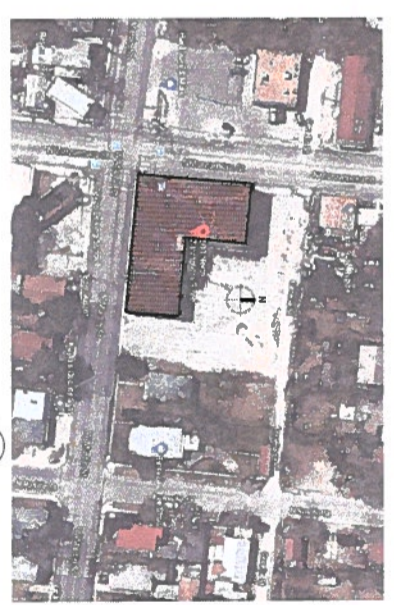
02 PROJECT LOCATION NTS