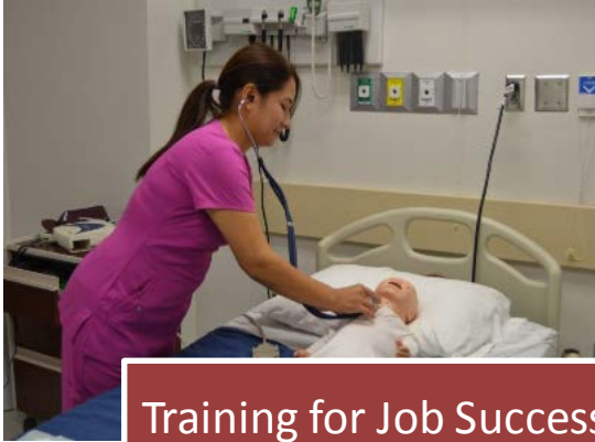
Training for Job Success

Job training support to obtain a job in a high demand occupation