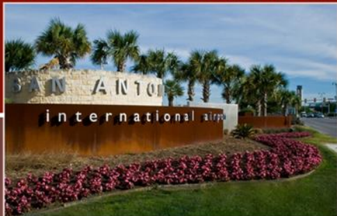
SAN ANTONIO INTERNATIONAL AIRPORT