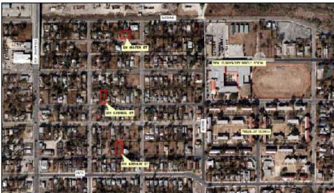
S P No 1736 Exhibit A Page No. SAHA