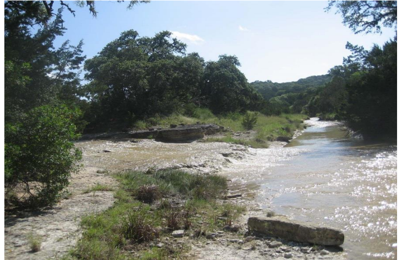
Middle Verde Creek