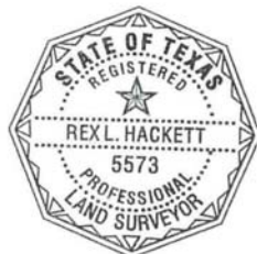
Rex L. Hackett Registered Professional Land Surveyor License Number 5573

This document was prepared under 22 TAC §663.21, does not reflect the results of an on the ground survey, and is not to be used to convey or establish interests in real property except those rights and interests implied or established by the creation or reconfiguration of the boundary of the political subdivision for which it was prepared.