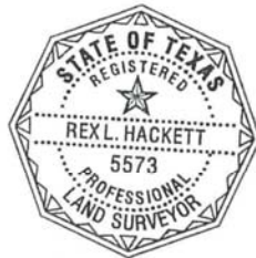
Rex L. Hackett Registered Professional Land Surveyor License Number 5573

This document was prepared under 22 TAC §663.21, does not reflect the results of an on the ground survey, and is not to be used to convey or establish interests in real property except those rights and interests implied or established by the creation or reconfiguration of the boundary of the political subdivision for which it was prepared.