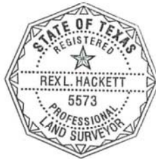
Rex L. Hackett Registered Professional Land Surveyor License Number 5573

This document was prepared under 22 TAC §663.21, does not reflect the results of an on the ground survey, and is not to be used to convey or establish interests in real property except those rights and interests implied or established by the creation or reconfiguration of the boundary of the political subdivision for which it was prepared.