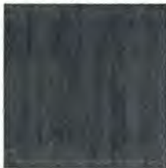
Sample Paul Brayton CAL 117 color - Almost Cedar

4.3.8 The outside colored vinyl upholstery for both Flyaway and Bernu models is Arconas Grade H, Paul Brayton CAL117, in the color "Almost Cedar".