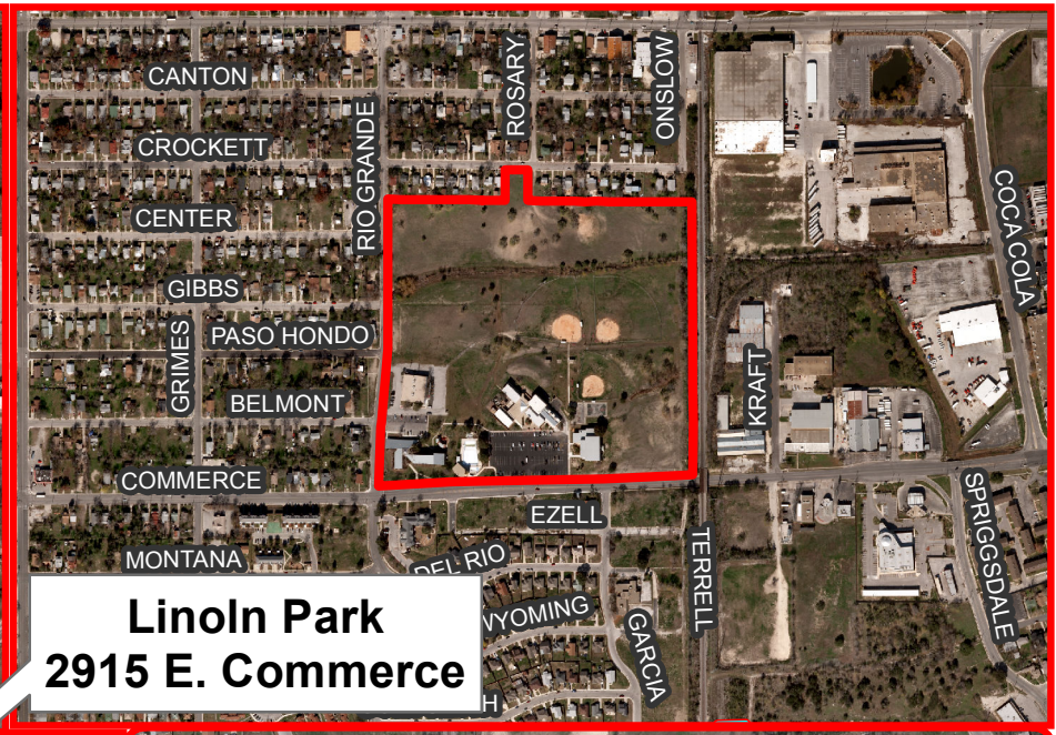
Lincoln Park 2915 E. Commerce