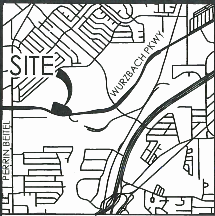
LOCATION MAP NOT-TO-SCALE