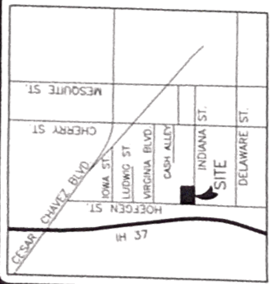
LOCATION MAP NTS

LEGAL DESCRIPTION: N52.3' OF LOT 5 & S87.3' OF LOT 5 BLOCK 6 NCB 649