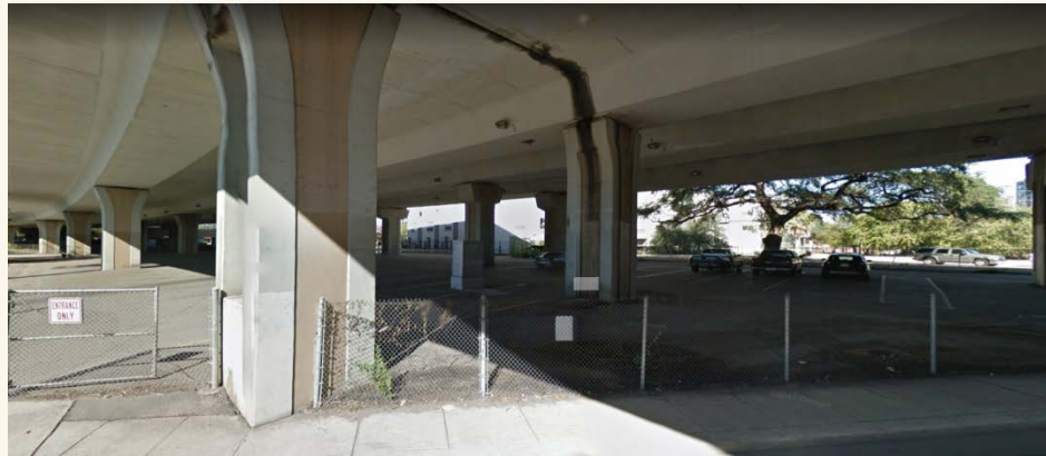
View from Camden Street