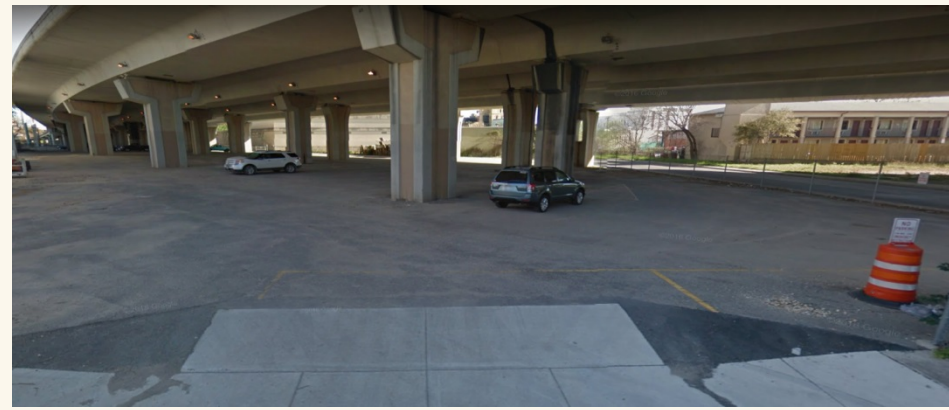
View from E. Quincy Street