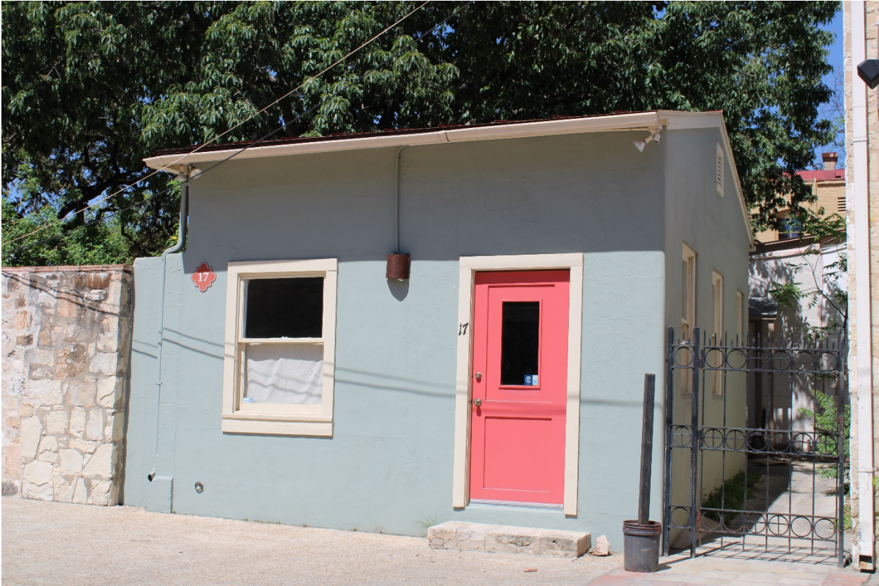
Bldg. 17 Facing East