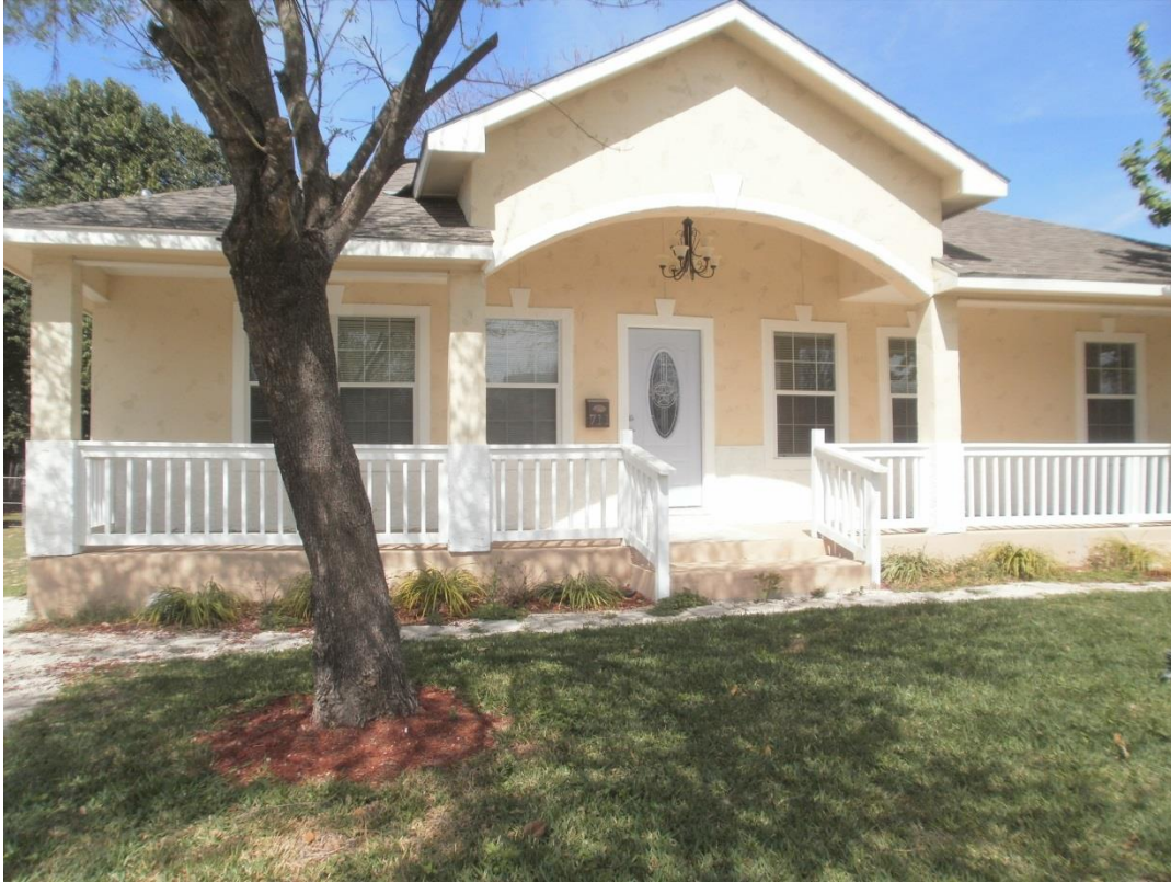
Home addition (Former garage) – one foot from side property line