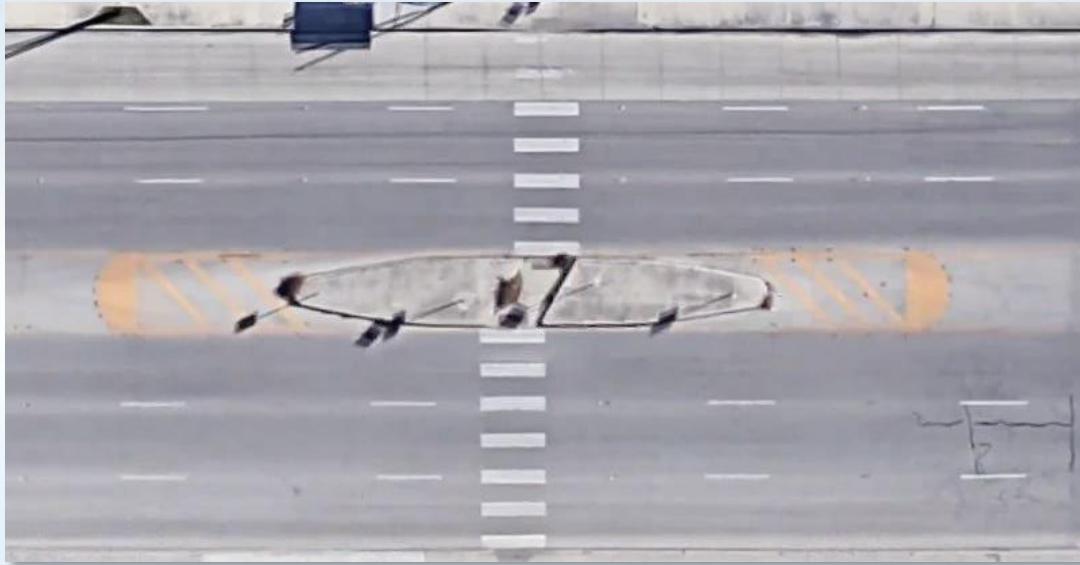
Pedestrian Refuge Island with Marked Crosswalk