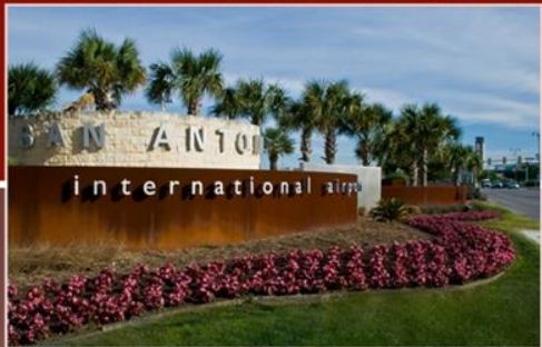
SAN ANTONIO INTERNATIONAL AIRPORT