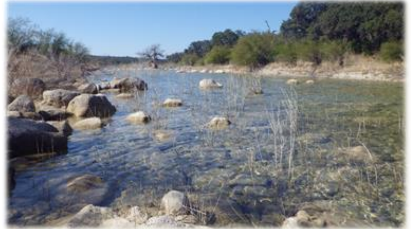
Sabinal River - Bludworth Ranch