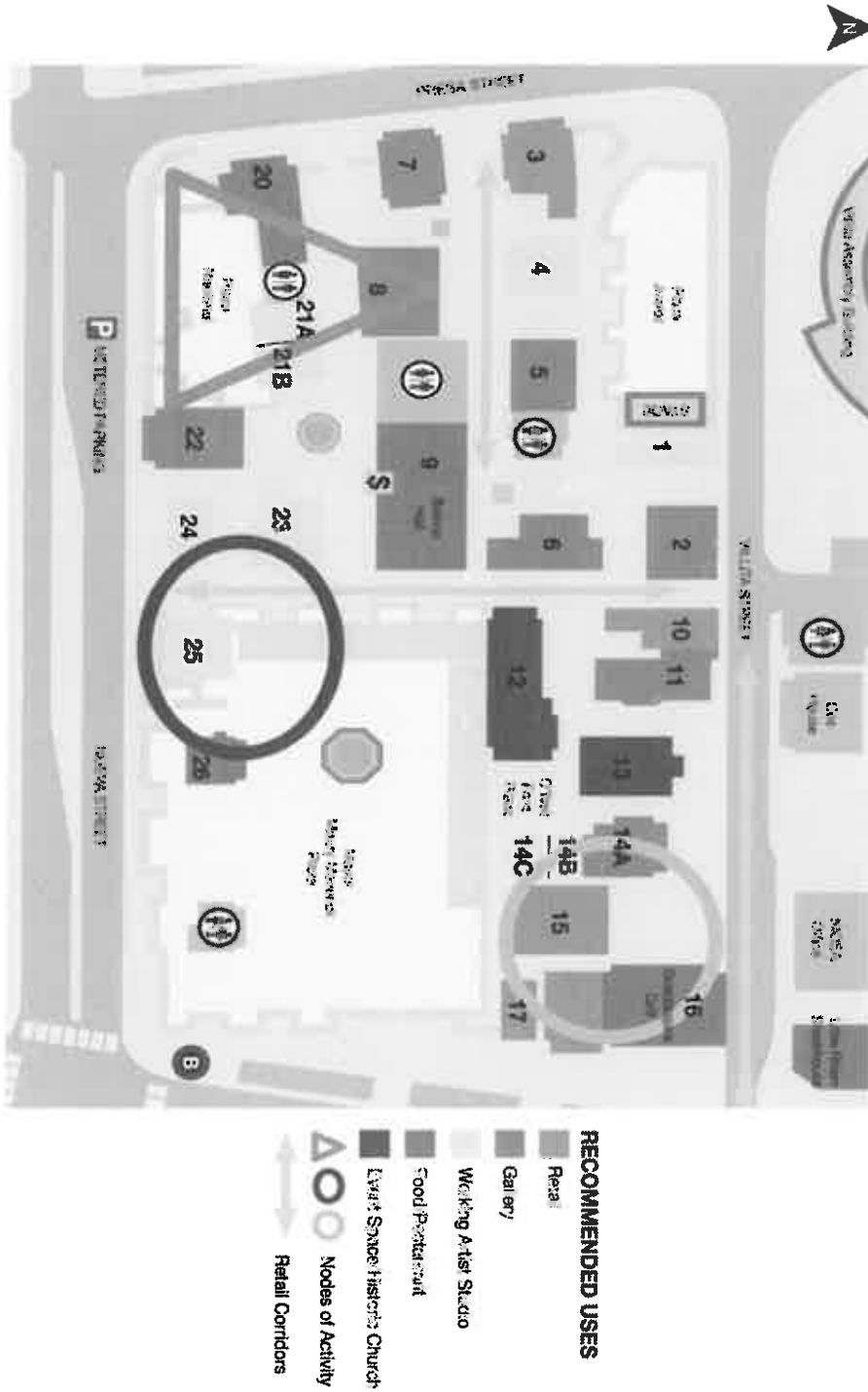
Exhibit A: La Villita Building Map