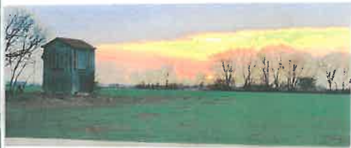
Sunset on the farm, at home, in Castroville, TX