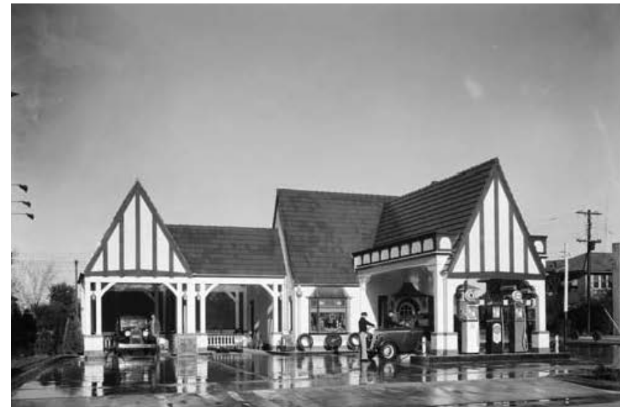
“Service station, no.2154; Gas Stations, Pure Oil” Houston, TX.