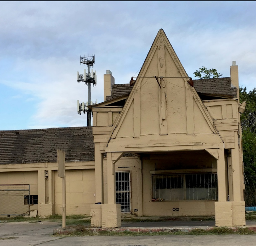
Gas station structure: contributing

Criteria: UDC Sec. 35-607(b) 1, 6, 8, 11, 12 and 15