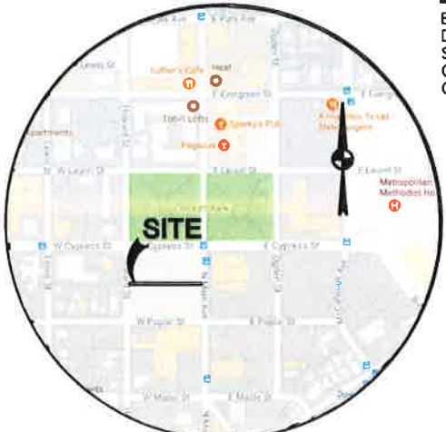
VICINITY MAP NOT TO SCALE SAN ANTONIO, TEXAS