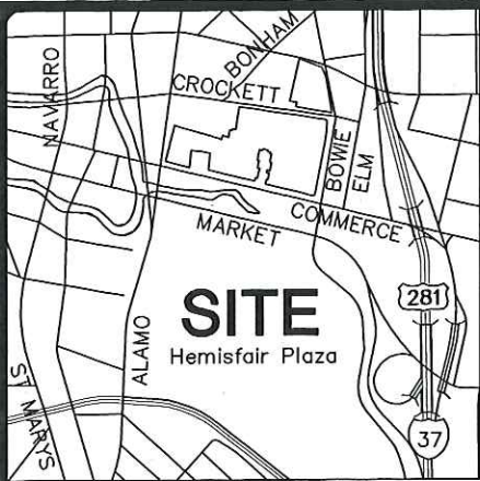
LOCATION MAP NOT-TO-SCALE