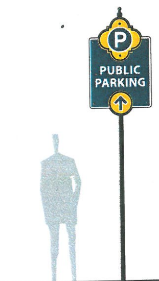
SA.1 Roadway Ramp Parking ID* Fabrication Details: Shts 4.1-4.2, 4.5