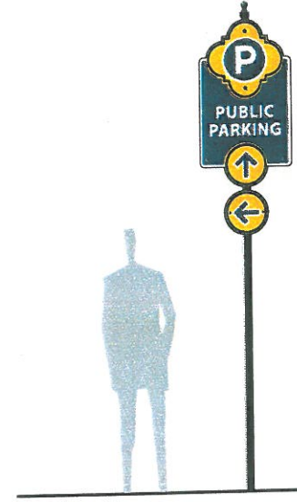
SA.2 Roadway Trailblazer Directional* Fabrication Details: Shts 4.3-4.5