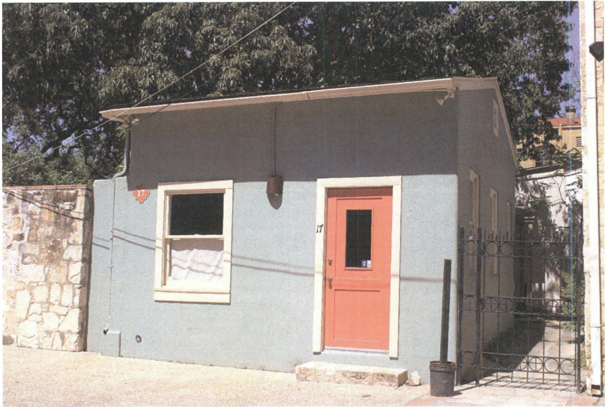
Bldg. 17 Facing East