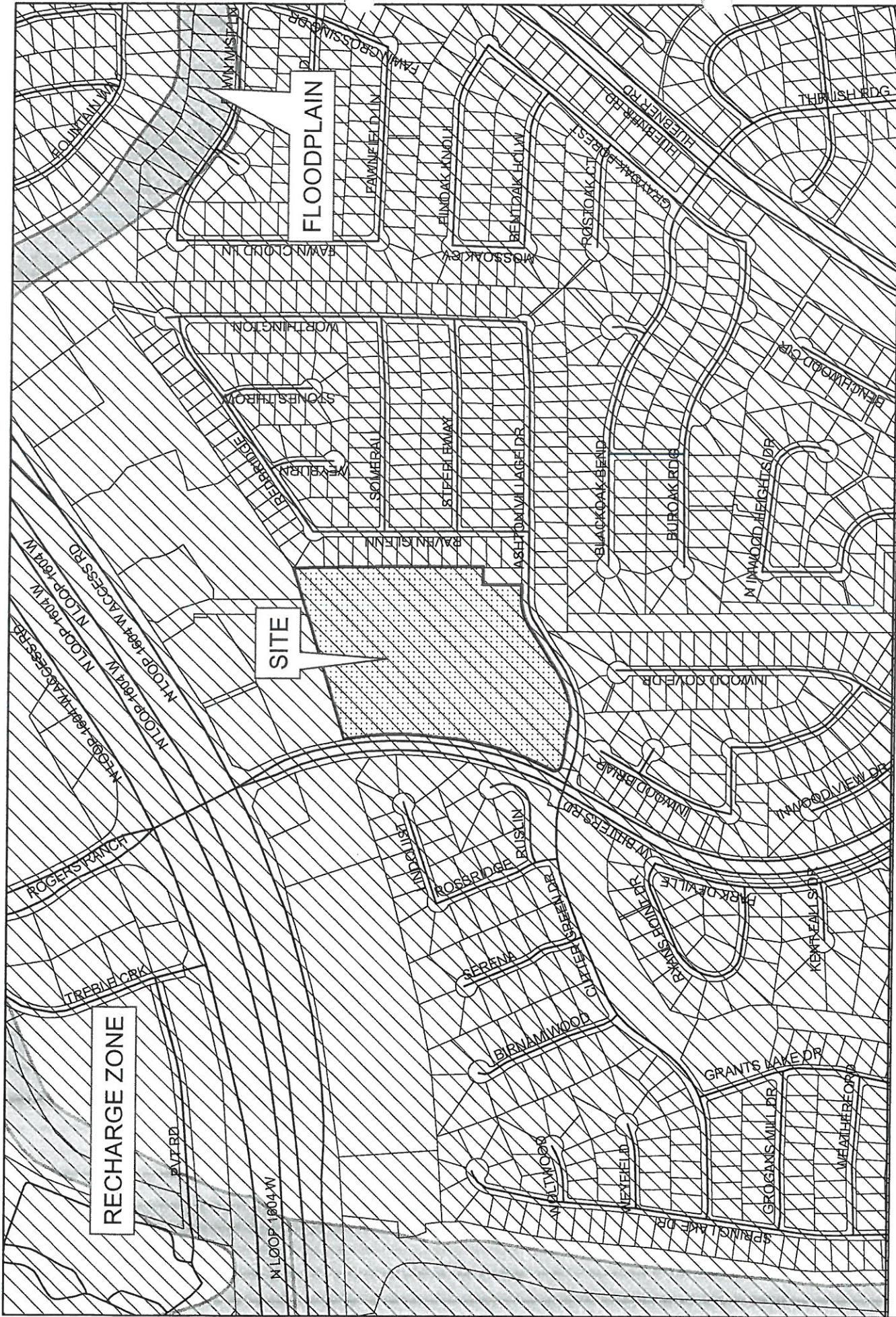
ZONING CASE: OFFICE DEVELOPMENT (FIGURE 2) ZONING FILE: Z2014103 Map Page & Grid: 515, F3 Map Prepared by Aquifer Protection and Evaluation 2/21/2014 ME