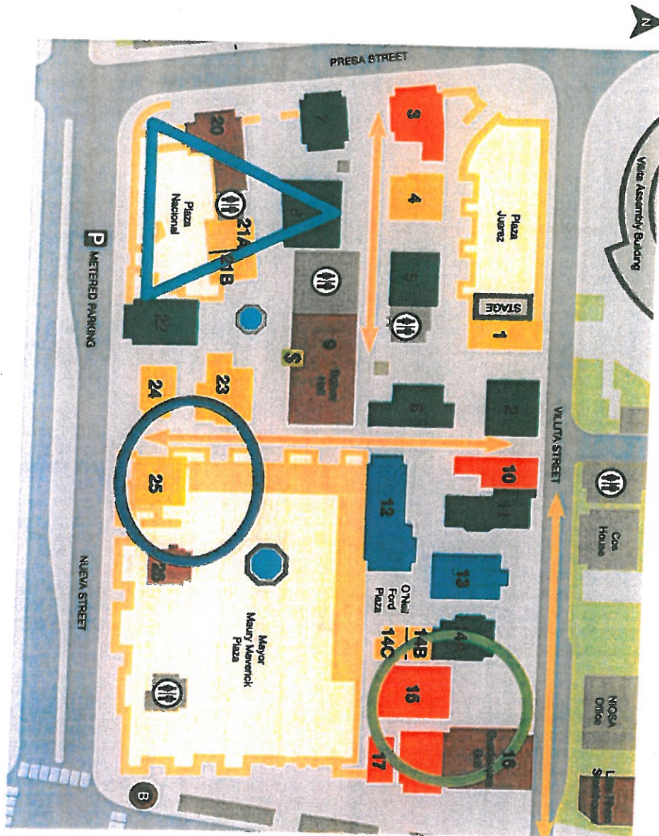
Exhibit A: La Villita Building Map