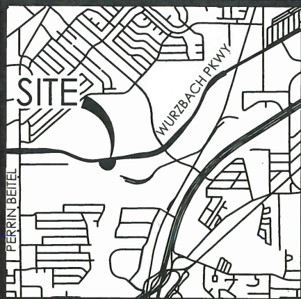
LOCATION MAP NOT-TO-SCALE