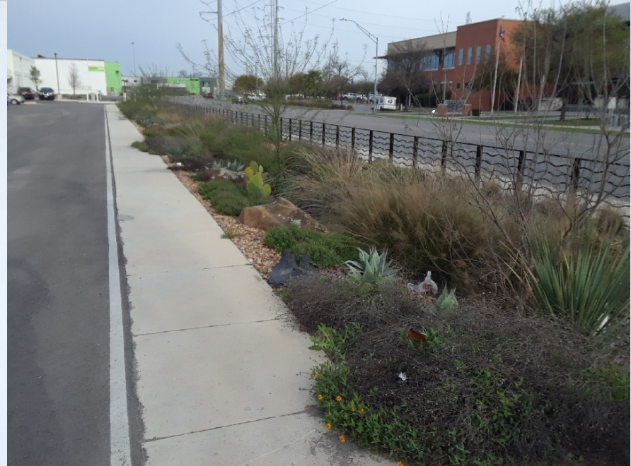
Low Impact Development (LID) Development Services Department