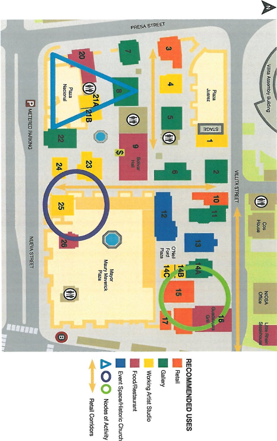
Exhibit A: La Villita Building Map