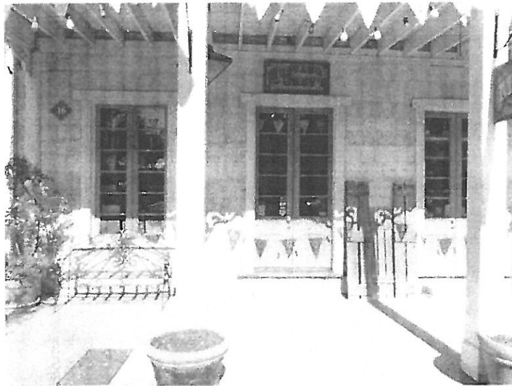
mortar is being repointed.

Windows and doors. Wooden window frames and sash need to be rehabilitated and some need to be replicated. Rear doors and windows are in poor condition and need to be replicated. Ten windows and door in process of restoration: