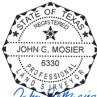
EXHIBIT OF A 2.064 ACRE PORTION OF WOODRUFF AVENUE NEW CITY BLOCK 10934, CITY OF SAN ANTONIO, BEXAR COUNTY, TEXAS.

JOHN G. MOSIER REGISTERED PROFESSIONAL LAND SURVEYOR NO. 6330 601 NW LOOP 410, SUITE 350 SAN ANTONIO, TEXAS 78216 PH. 210-541-9166 greg.mosier@kimley-horn.com