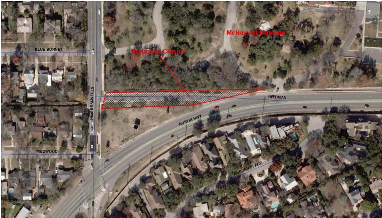
Aerial Photograph of Proposed Closure