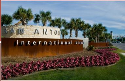
SAN ANTONIO INTERNATIONAL AIRPORT