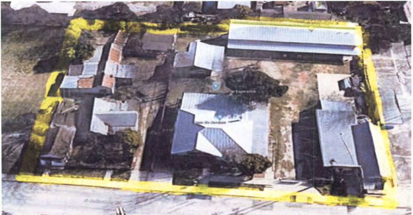
Looking East from S. Colorado