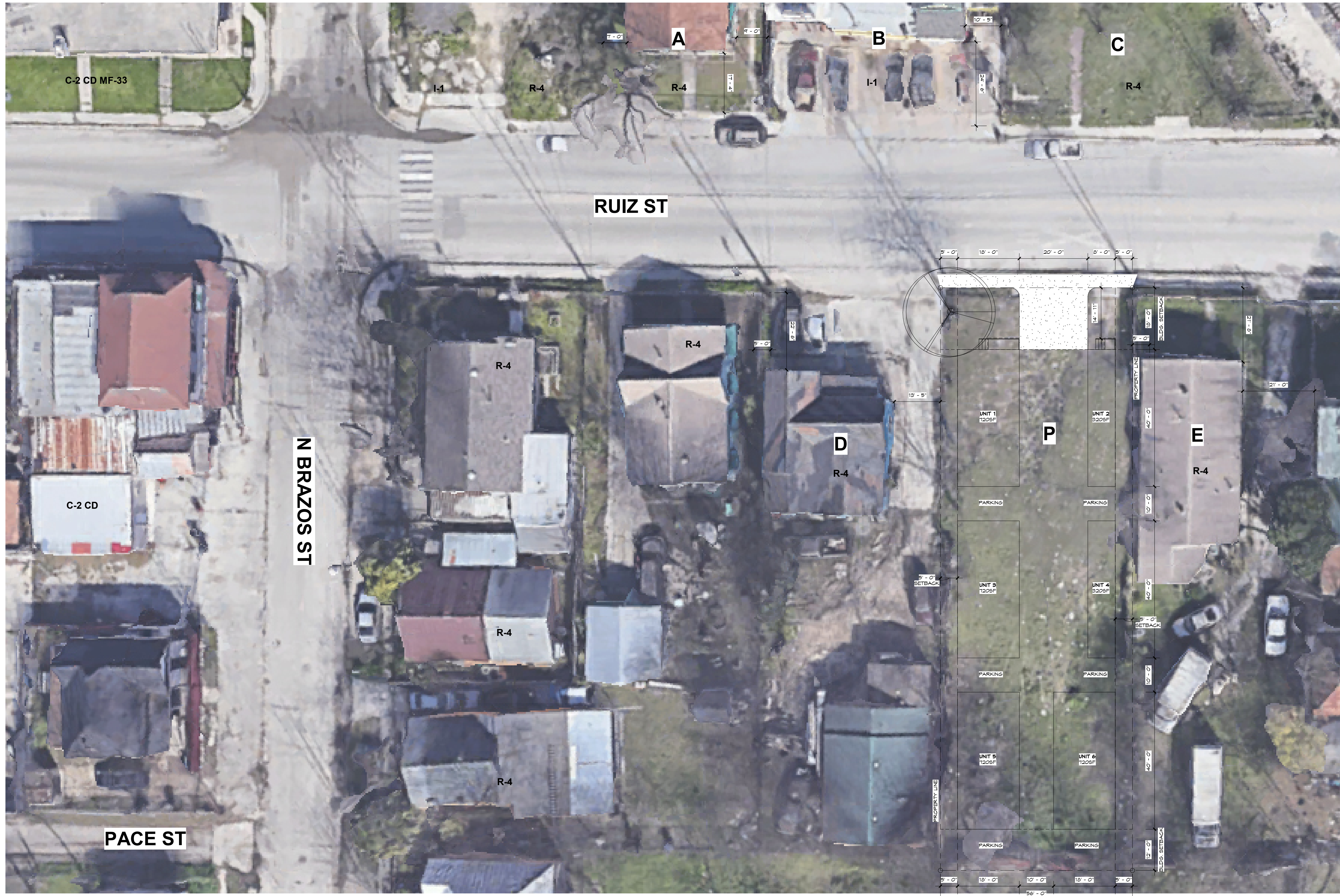
① GROUND PLAN COMPARISON 1/16" = 1'-0"