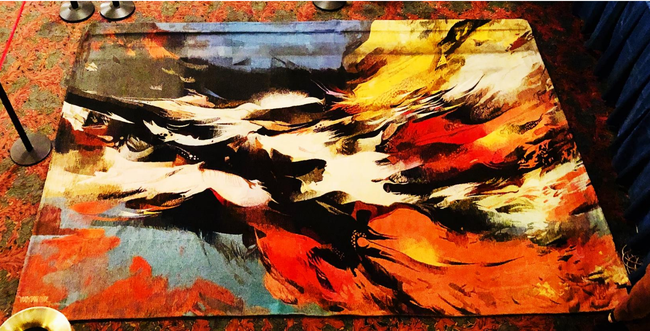
Leonardo Nierman, Untitled, c. 1980. Wool, 8' x 15'. Artwork value: $16,000.00