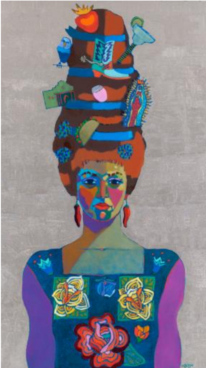
A River Runs Through it SA On My Mind