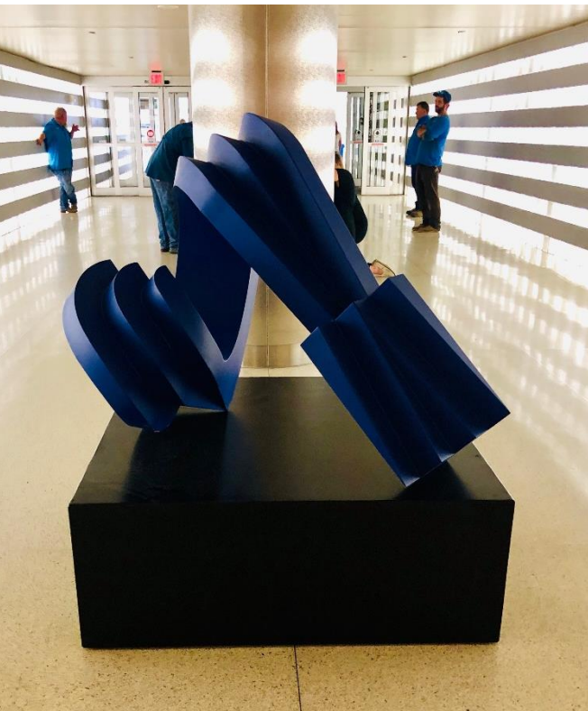
Rizo , 2002, painted iron.

Location: San Antonio International Airport Tunnel