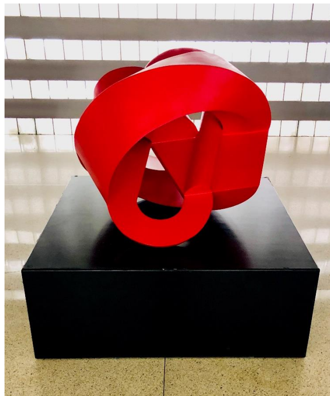
Home , 2015, painted iron.