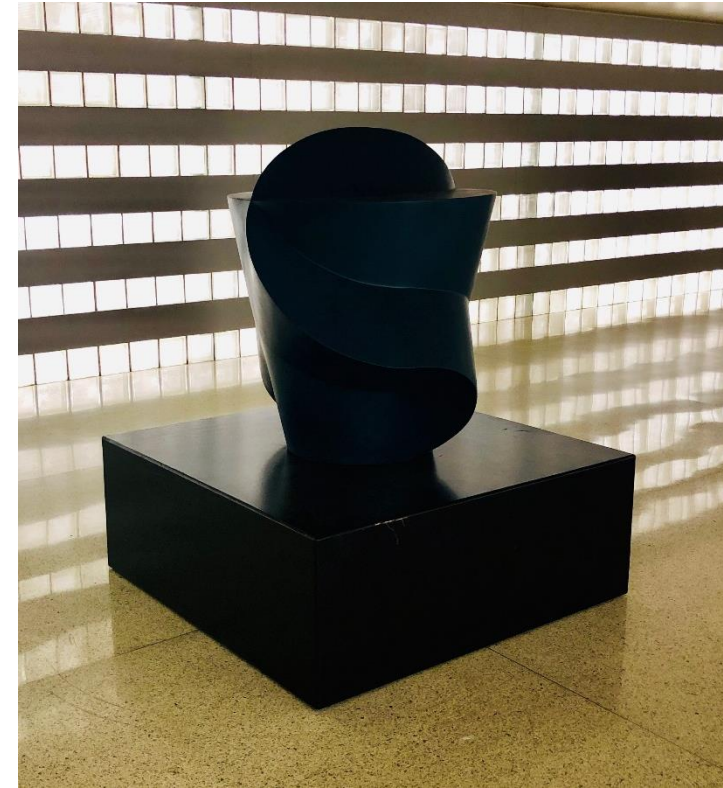
Corset , 2013, painted iron.