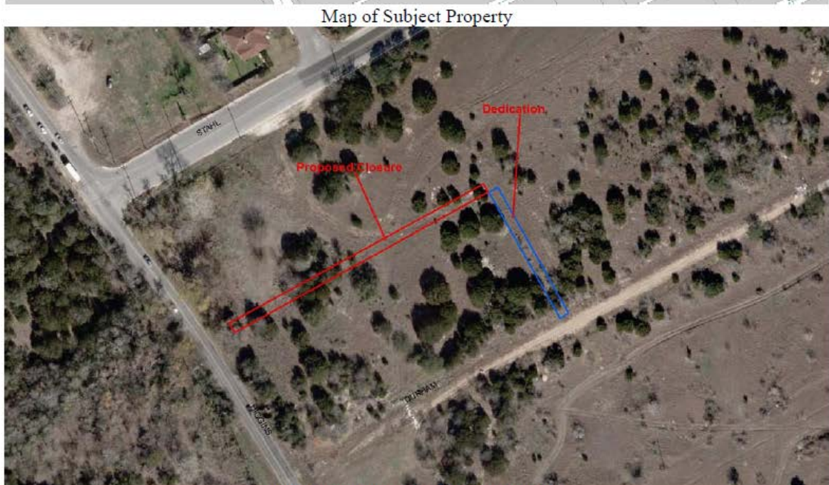
Aerial Photograph of Subject Property