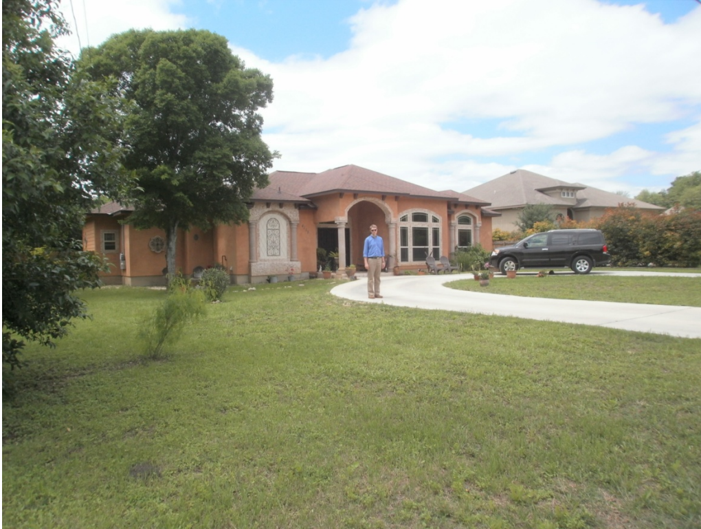
Neighboring Home staff standing at 25 ft