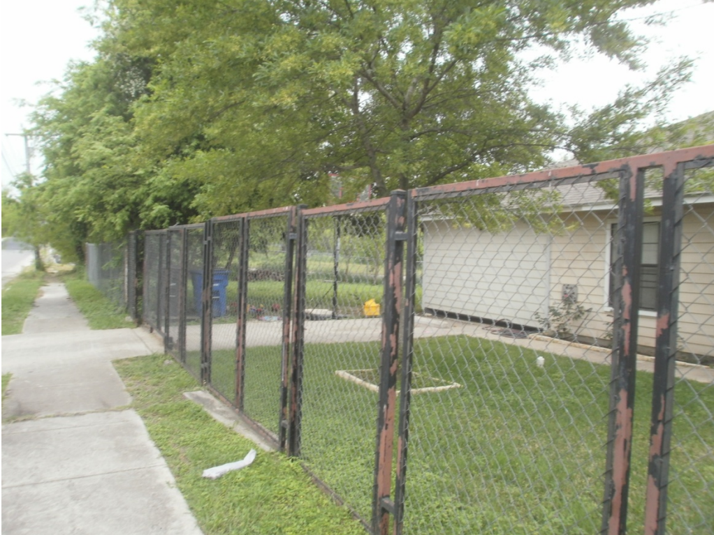
627 N. San Gabriel– Subject Property