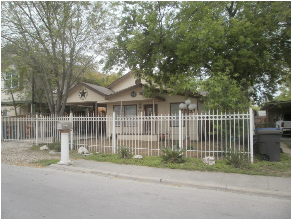
Across Street Neighbor Fence