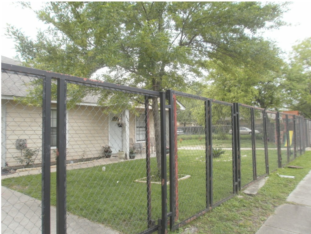
6 foot front fence