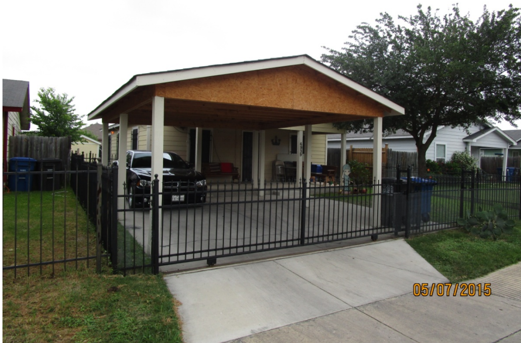
Wood carport posts two feet from side property line