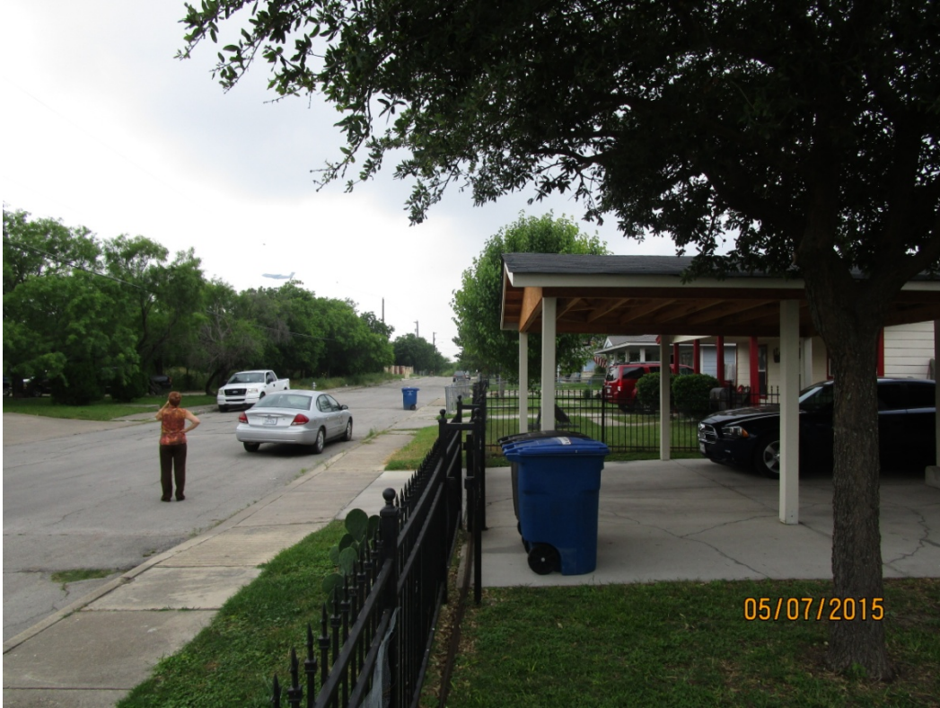
Eave overhand six inches from property line