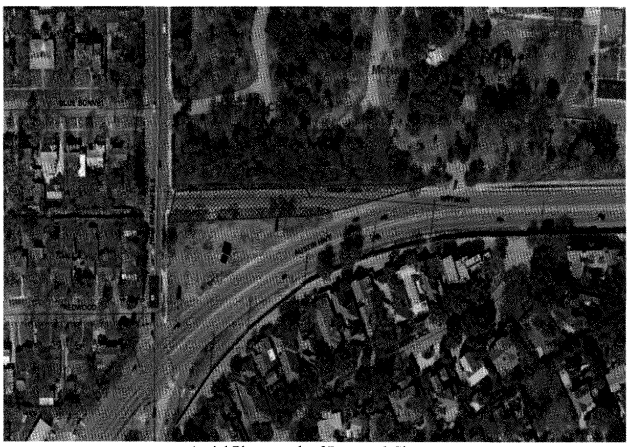
Aerial Photograph of Proposed Closure