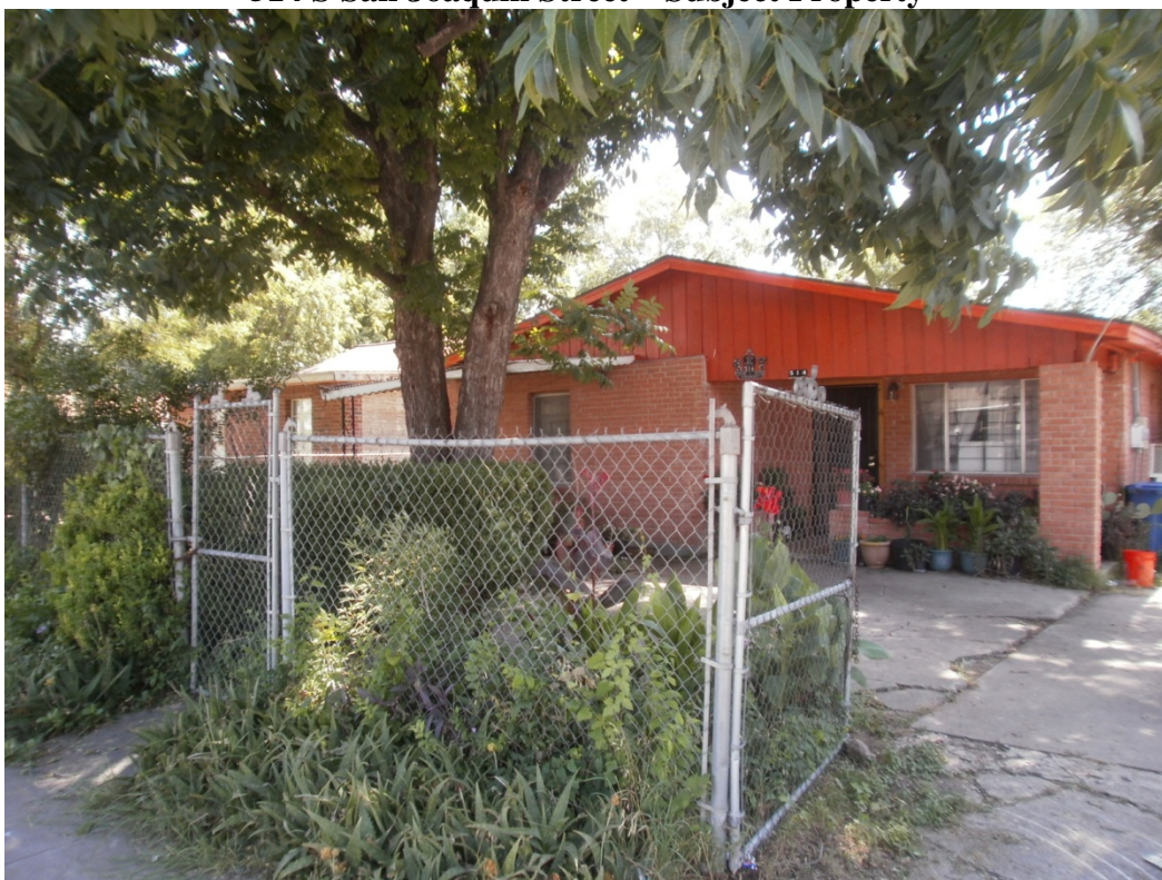
View of carport from street