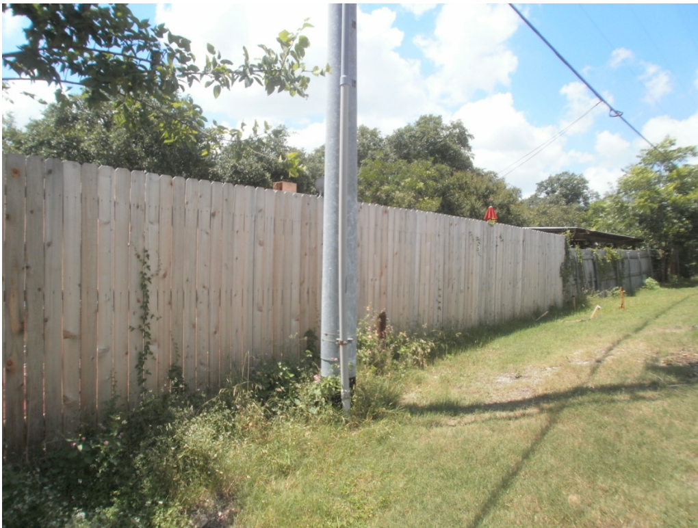
Stair-step fence design