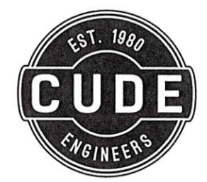
Exhibit A - 3