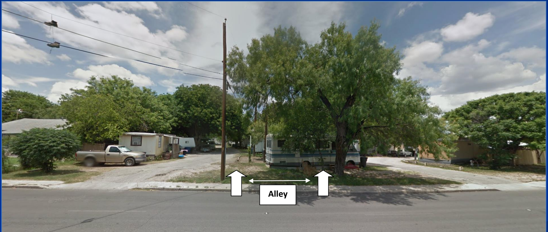
Approximate location of alley – View from East Southcross