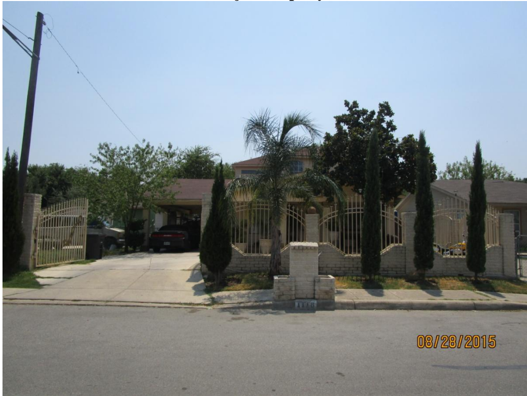
Eight foot tall fence