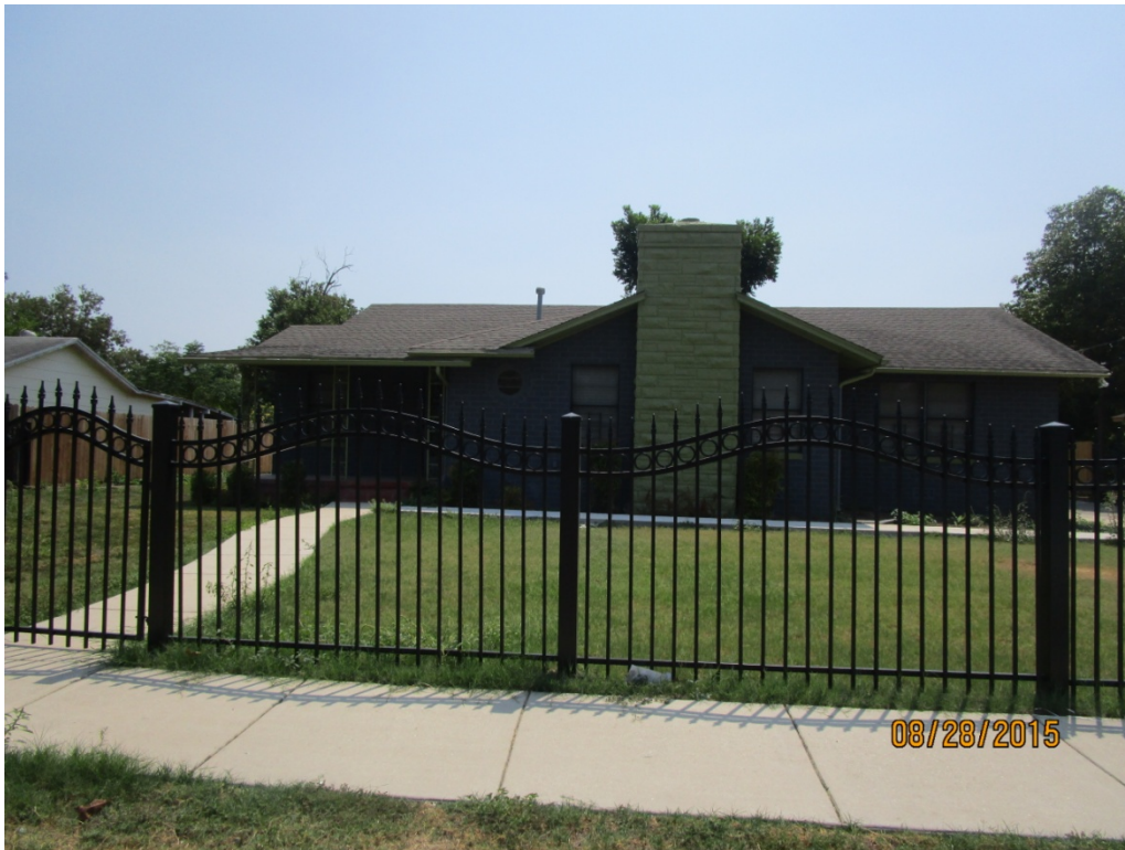
Posts measure 4 foot 9 inches