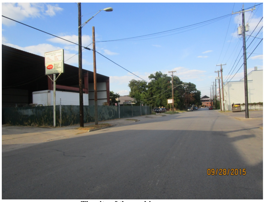
The site of the parking garage