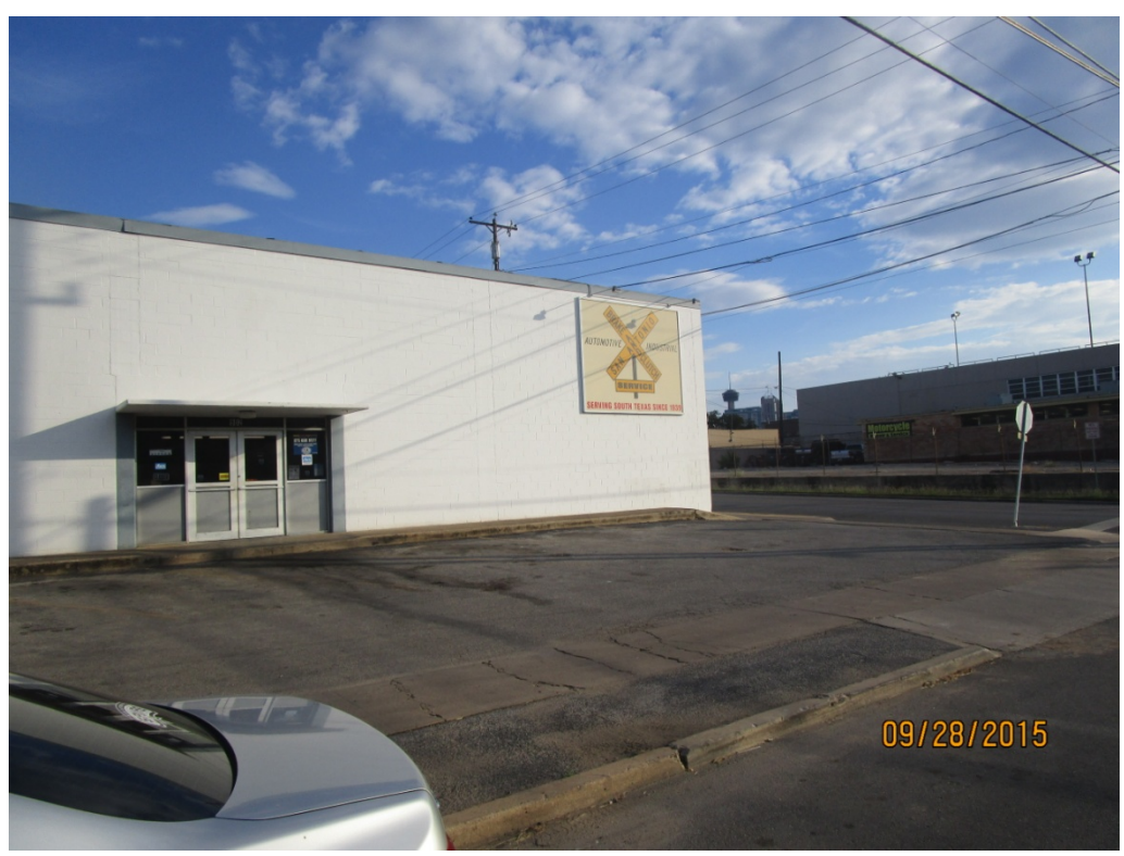
Across street from garage location