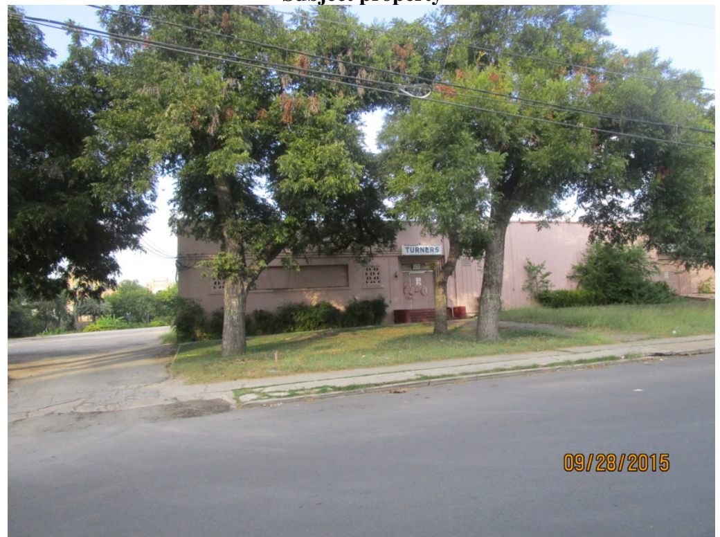
The location of the residential building