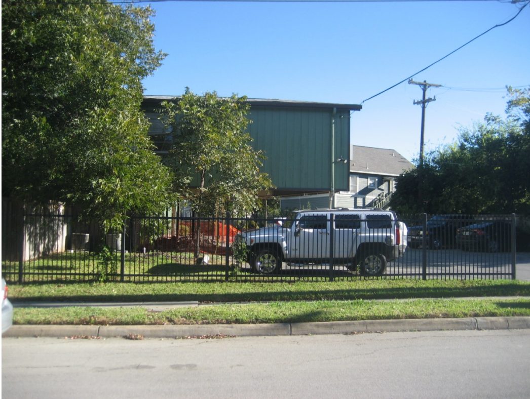
Directly across the street