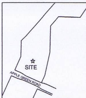
LOCATION MAP (N.T.S.)

VARIABLE WIDTH DRAINAGE R.O.W. PHEASANT CREEK UNIT 5 VOLUME 9531, PAGE 2 DEED AND PLAT RECORDS BEXAR COUNTY, TEXAS